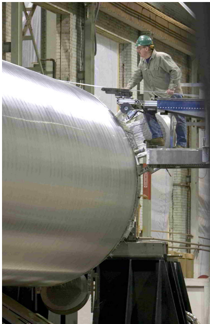
The bundle winding process for each coil wound heat exchanger manufactured by Air Products.