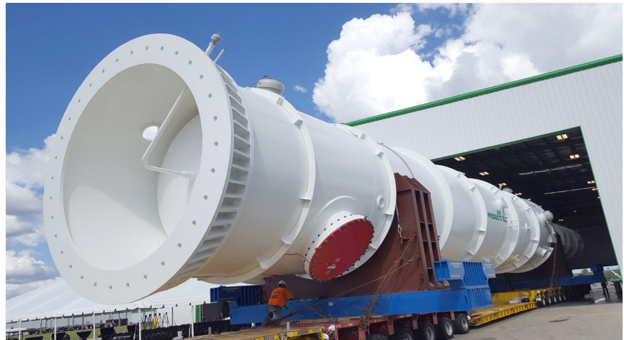
A large Air Products' custom designed coil wound heat exchanger.

For the AP-X® LNG Process, in addition to liquefaction process design and CWHEs (Coil Wound Heat Exchangers), Air Products designs and manufactures cryogenic nitrogen compressors (compressor turbo-expander machinery), and nitrogen economizer heat exchanger cold boxes.